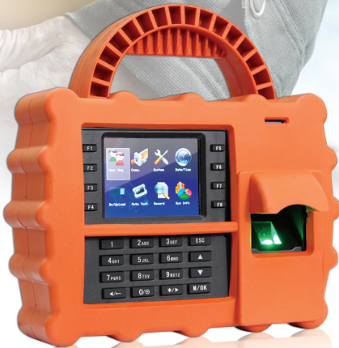
Portable Device with a Rubber Coating